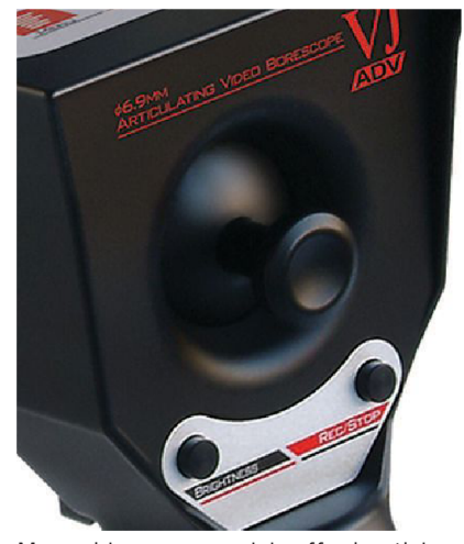
Many videoscope models offer joystick camera-articulation control.

that deliver the necessary illumination. The result is that there are now video borescopes that deliver all of the key features–joystick articulation control, direct micro-camera imaging, on-board photo and video storage–at a fraction of the price seen only five years ago.