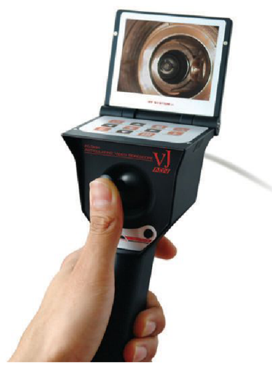
The base imaging unit houses the main PCB, camera articulation controls, video monitor and power supply.

One of the key trends occurring with video borescopes is the simplification of design in order to allow the technology to "trickle down" into applications that previously did not justify the expense. This same trend occurs in many other technical and consumer product categories, from flow meters and thermal imaging cameras to GPS and digital cameras. With technology in general, devices that at one time were very expensive and complicated tend to become more affordable and easier to use, opening the door to much wider adoption. In the case of video borescopes, this "trickle down" trend has been fueled by the ever-smaller and more powerful cameras developed for use in cell phones and laptop computers, as well as advancements in micro-LEDs