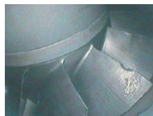
Chip in Turbine Blade