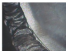
Pipe weld image taken using the VJ-3 articulating video borescope

Inspection of tank cars can be expensive and time-consuming, but it is critical for safety when transporting hazardous materials. Abrasion, corrosion, cracks, dents, distortions, or defects in welds, are all indicators that an inspection is required.