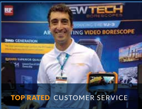
TOP RATED CUSTOMER SERVICE

TRY IT BEFORE YOU BUY IT NO-COST DEMO PROGRAM