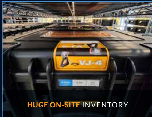
HUGE ON-SITE INVENTORY